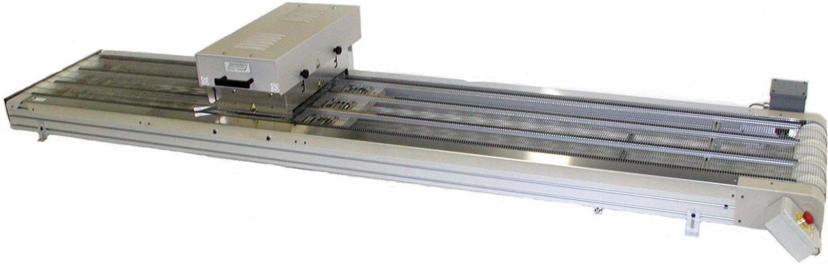
Model 105M with 24" entry extension and 56" exit extension.