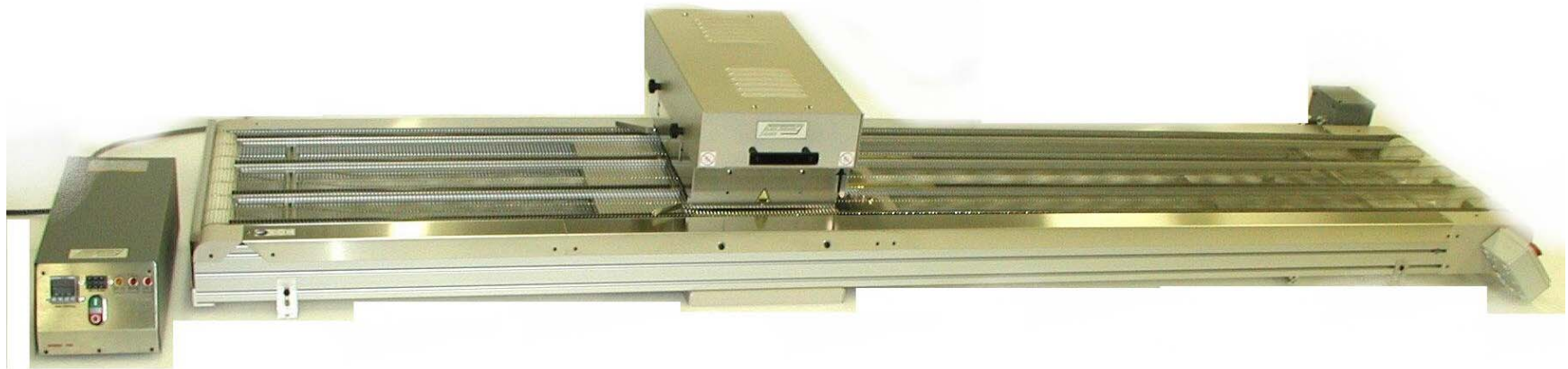
Model 105M with 24" entry extension and 36" exit extension.