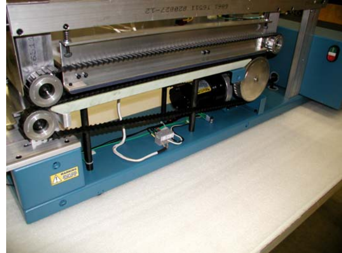
Direct Drive with Low Friction Idler Pulleys Right Side