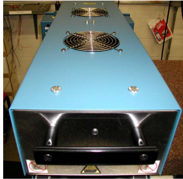
M175 Quick Release Fasteners Top Cover