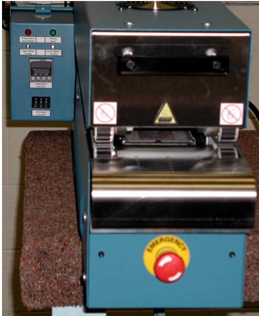
M175 Controls with E-Stop