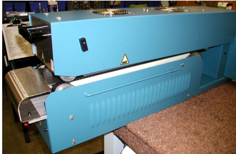
M175 Quick Release Fasteners Side Covers