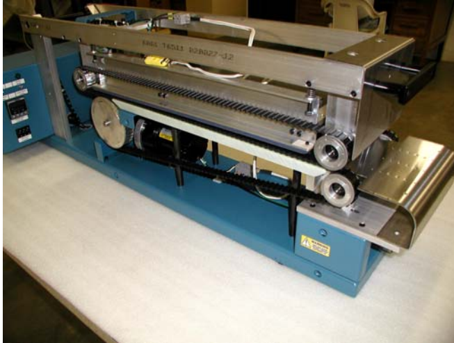
Direct Drive with Low Friction Idler Pulleys Left Side